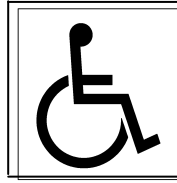
International Symbol of Accessibility

“ HANDICAPPED PARKING PERMIT REQUIRED “ and “ VIOLATORS WILL BE FINED MINIMUM $150.00 “ in addition to the international symbol.